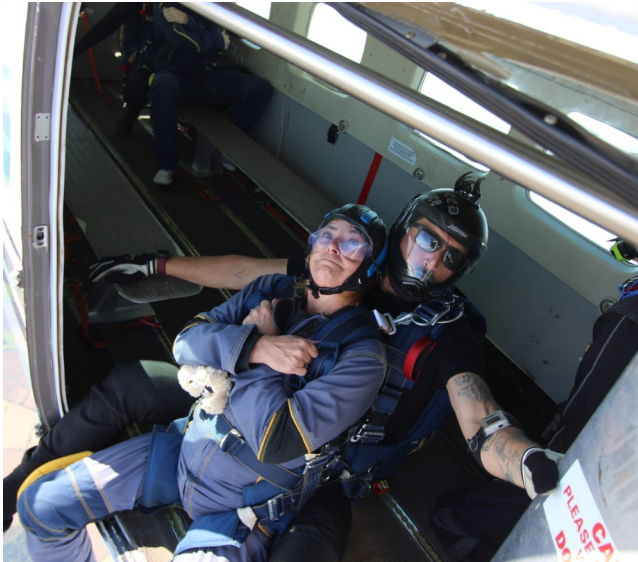
Time for one last prayer....