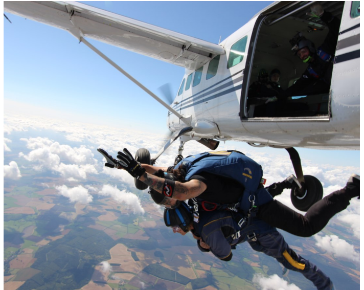
And they're off into freefall.....